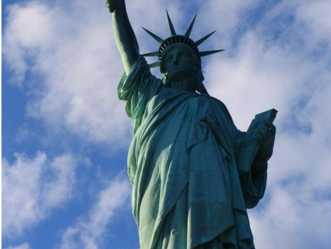
STATUTE OF LIBERTY